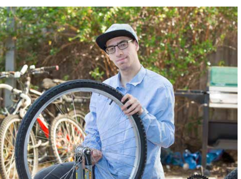
Mind is working to deliver the most appropriate support to NDIS participants with psychosocial disability.

National Disability Insurance Scheme (NDIS).